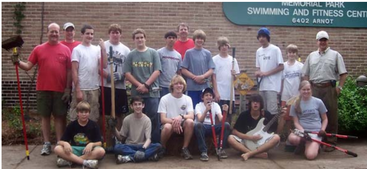
Boy Scout Golden Arrow Troop 11 and supporters

Located just outside the entrance of the park's Swimming and Fitness Center, the Garden provides critical habitat for both adult and larval (caterpillar) butterflies. Urban gardens with native plants are essential to the survival of these delicate and beautiful creatures. Thank you Andrew and Troop 11 for all of your hard work.