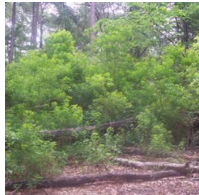
Tallow trees are an invasive species that inhibit naturally occurring pine tree regeneration here in the park.