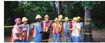
The SCA Green Team officially opens the Crestwood Trail.

of the Memorial Park Conservation Master Plan . This trail will become a dedicated and well maintained route for joggers, hikers and bicyclists. The students also spent several days removing hundreds of invasive plants from this area of the park and restoring three degraded trail areas along the Green Trail. Thanks to our wonderful volunteers from the SCA for making Memorial Park an even better place for all Houstonians! Click here to find out more about the SCA's Green Teams Program!